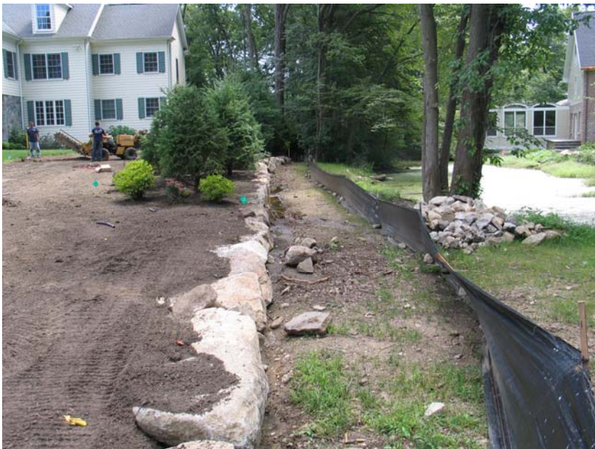
Rock wall and associated fill within the front yard is pictured. Additional site work has occurred in other areas of the site. Wetlands and watercourses, Rizzuto site, to right.

Land disturbance, wall construction, and alteration of vegetation within wetlands and within buffer/setback areas to wetlands and watercourses without the required EPB permit is a violation of the Board's Inland Wetland and Watercourses Regulations. In addition, the unauthorized site work may have impacted the functioning of the storm water management facilities.