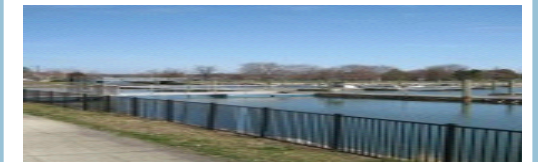
View of Cove Island Marina